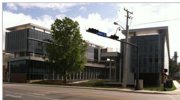
View of the CTRB from Gale Lemerand Drive.