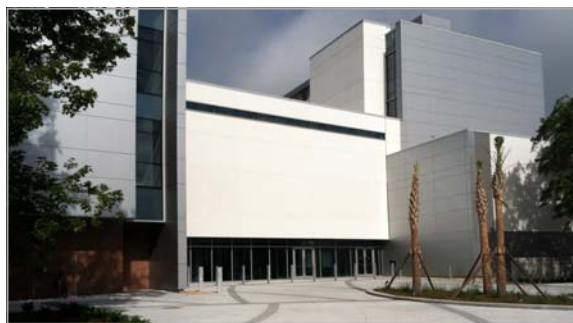
View of the CTRB main entrance off Mowry Road.