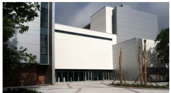
View of the CTRB main entrance off Mowry Road.