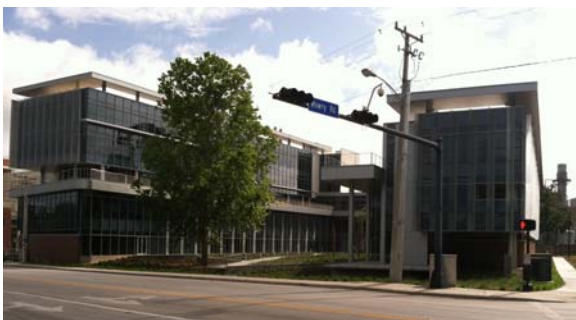
View of the CTRB from Gale Lemerand Drive.

Faculty, staff and students with appropriate parking decals could optionally park in the following areas nearest the CTRB: parking garage adjacent to the CTRB (orange, blue, official business, medical resident, carpool; gated beginning 6/24/2013), Pony Field surface lot (gated), commuter lot (green), Garage 3 West (gated, blue, medical resident, carpool).