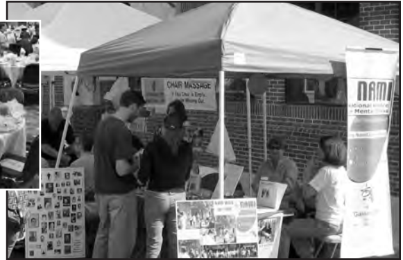
NAMI booth at the Downtown Fall Arts Festival in November.