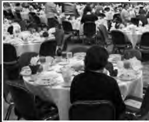
Luncheon for the University of Florida Capital Campaign